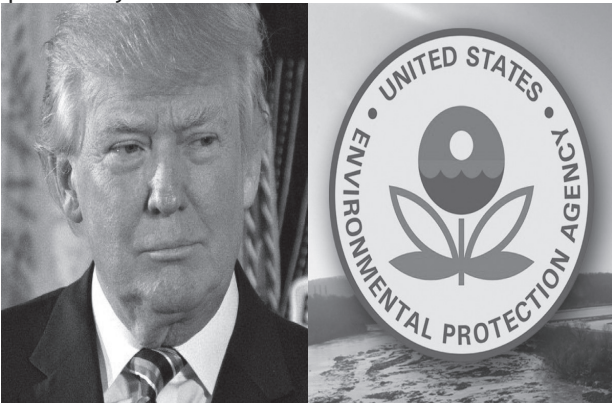
CLIMATE CHANGE: President Trump believes it is possible to expand economically and still save the environment. Recent budget cuts to EPA and NOAA will make it a challenge.

We have a leader of the EPA who is against renewable energy and for burning fossil fuels and a president who wants to weaken environmental policies already put in place. If we don't fight these changes to laws that have helped keep our Earth from dying at an alarming rate, we may be past the point of fixing our environment. Contact your congressional representative and take a stand in defending our planet!