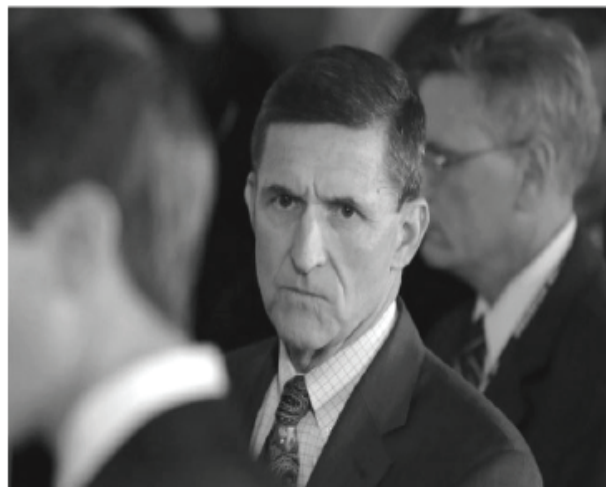
National Security Advisor Michael Flynn is seen before a press conference with Canadian Prime Minister Justin Trudeau and President Trump at the White House on Feb. 23.

The Pentagon's top watchdog has launched an investigation into money that former national security adviser and retired Army Lt. Gen. Michael Flynn received from foreign groups, a new wrinkle in the downfall of President Trump's ousted national security adviser.