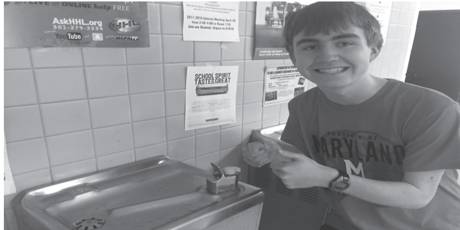
First: The Media Center provides resources and clean water fountains.